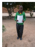
Some of this year's form one students