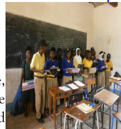
Kiwere students happy after receiving their school essentials.