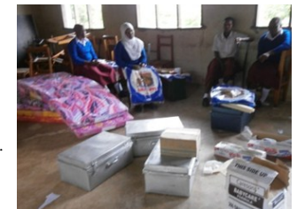
Right: Replacement of school necessities.

Thanks to the generosity of sponsors and supporters we were able to respond immediately to replace all our students' lost items and are continuing to receive funds to replace bunk beds over the next few months.