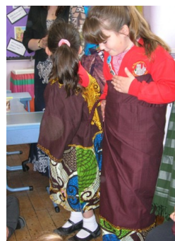
Children trying on Tanzanian costumes.