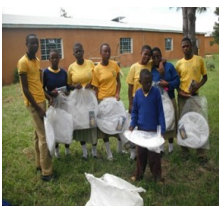
Kiwere students with mosquito nets.

May: "It was the day for visiting the optician, several shops and we also went to the tailors for making trousers for two students. On Tuesday Idodi students came as we went for eyes test and buying glasses, buying dictionaries, exercise books and those needs asked by the students during our visit including mattresses for some Kalenga students. Thanks I have managed to buy those needed things."