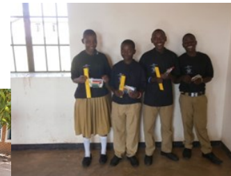
Students from Kiwere School

18 March 2014 Today I made a trip to Kiwere secondary school, as soon as I reach there I went to meet head of the school for short discussion. After that I went to meet students in the class for short stories before starting our class and then I provided t-shirts to our students. The students look so very happy and bright with their new t-shirts, I also provided the pencils case and ruler for the new students.