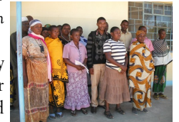
Parents of SEED students at meeting, with ex-students.

“... we had the meeting with parents at Kiwere secondary we had a good support from Headmistress, second master and Academic master of the school....parents responded very positively to the meeting. Here also I started with introduction of SEED organization, leaders, short history as well as head office and where we are at Iringa office, parents introduce themselves