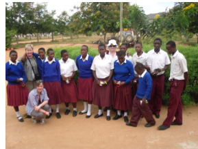
Students at Kiwele with the UK group